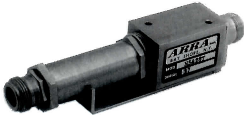
Model No. N5428T Form 5277