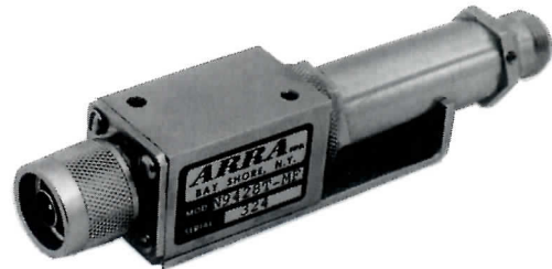
Model No. N5428T-MF Form 5277-1